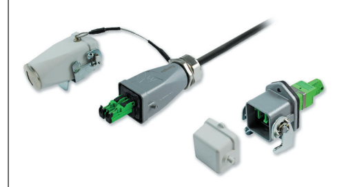
revos E-2000® connector and bulkhead, 2 optical channels